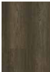
180 Fumed Oak