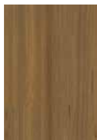
655 Forest Reds