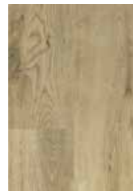
540 River Oak