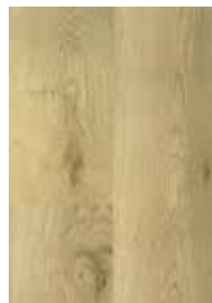
300 Autumn Oak