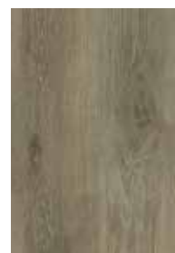
720 Summit Oak