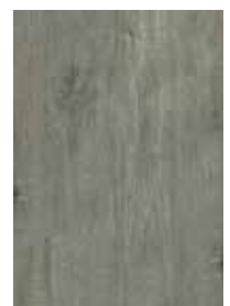
750 Carbonised Oak