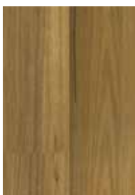
550 Western Tallowood