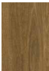
555 Spotted Gum