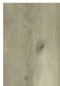
710 Frosted Oak