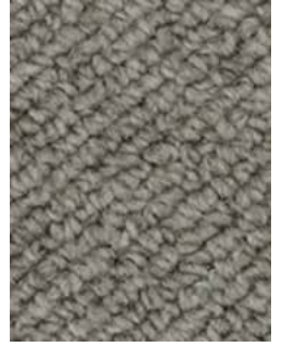
730 Grey Mist