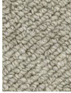
710 Tawny Stone