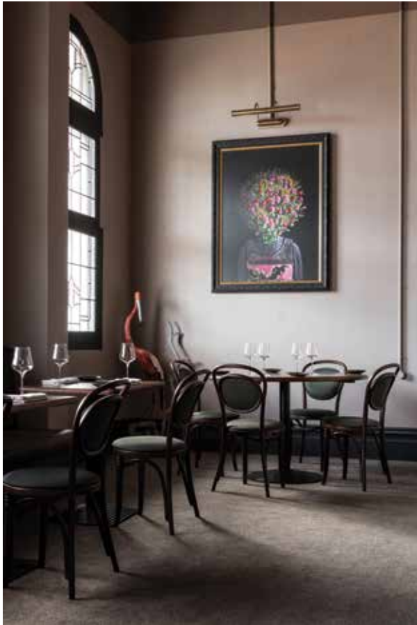
The Royal Hotel