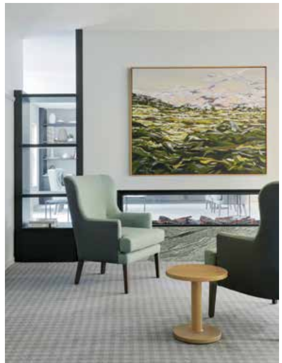
Eva Tilley Memorial Home

The schedule should provide for recording of actual work, done and by whom it is performed, and shall be maintained for reference should any cleaning problems arise. The schedule should be amended as necessary when there is a significant change in the pattern of use of any area.