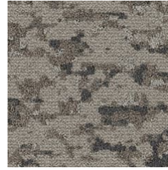
0829 GREAT HORNED