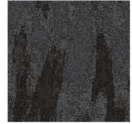
0969 GREAT GREY

Specifications and colourations are subject to manufacturing tolerances. As part of the GH Commercial continuous improvement program, GH Commercial reserves the right to change the specifications of or delete colours of this product without notice. While all care is taken, product images may vary in colour due to possible printing process variations. Images do not seek to duplicate the exact visual appearance, but serve merely as a guide or point of reference.