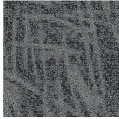
0949 WESTERN SCREECH